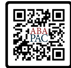
PAY BY CREDIT CARD